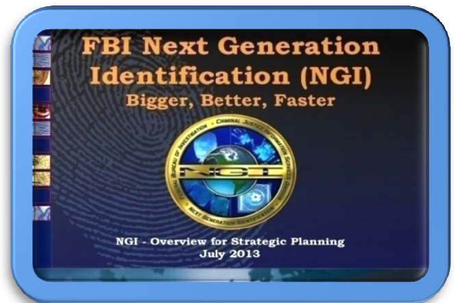
Figure 2. Next Generation Identification System.

FBI Next Generation Identification (NGI) system collects and processes the data, and identifies the eyes, fingerprints and iris (Figure 2). The system responds to high level requests in real-time mode as soon as possible [4].